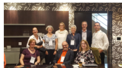
Cochrane Fields' meeting